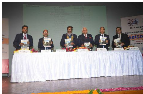
NABICON 2017 Souvenir being released during Inaugural Ceremony