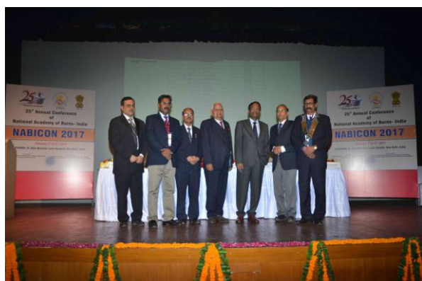
Dignitaries on the dais during Inaugural Ceremony

The DGHS was the chief guest at the inaugural function where all the past presidents of NABI were felicitated on stage .The executive body meeting and General Body meeting were held as scheduled. All in All the conference was a huge success .