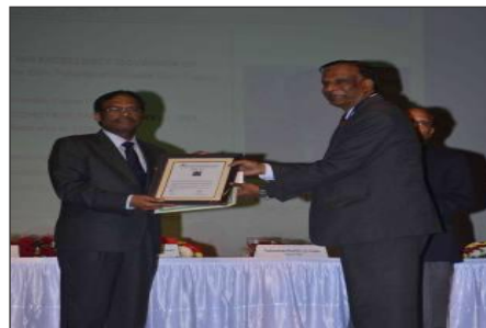
Past Presidents being felicitated during the inaugural function